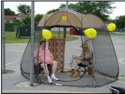
Portraits by Dominic Sanson